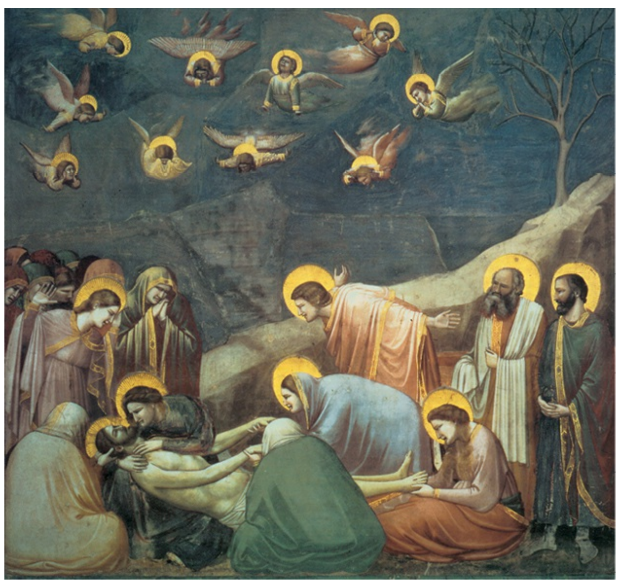
Lamentation of Christ. In The Lamentation of Christ, also by Giotto, Jesus' family and disciples receive his body after it has been removed from the cross.